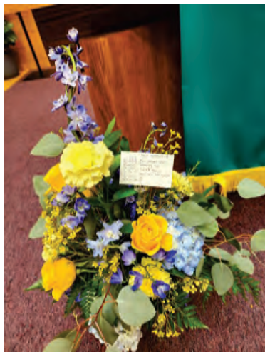
Flowers from WMANNCA