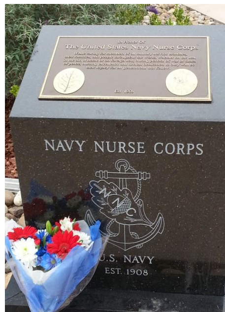
Navy Nurse Corps Memorial Miramar National Cemetery “In Memory” of those lost, but not forgotten on 9-11-01