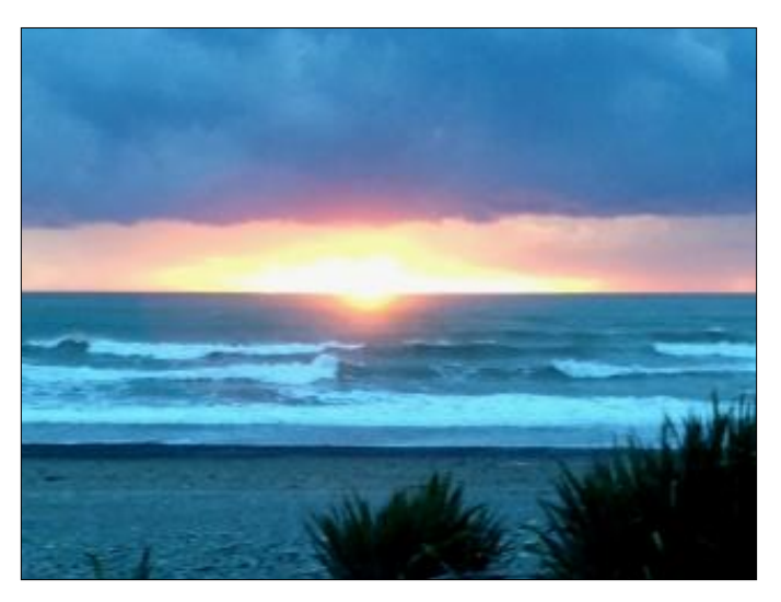
Sunset over the Tasman Sea, off west coast of NZ