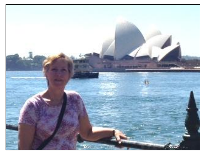
Sydney Opera House where we saw La Traviata