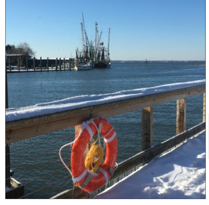
Our Shem Creek meeting place - under January snow!