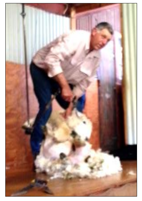
Sheep shearing in NZ