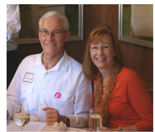
The October 2017 General membership meeting at Middleton Place. Great lunch, fellowship, door prizes and a record turnout!