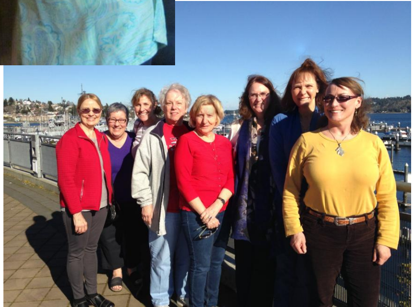
Board meeting February, 2015 Bremerton