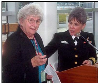
Red Cross Award, 2006