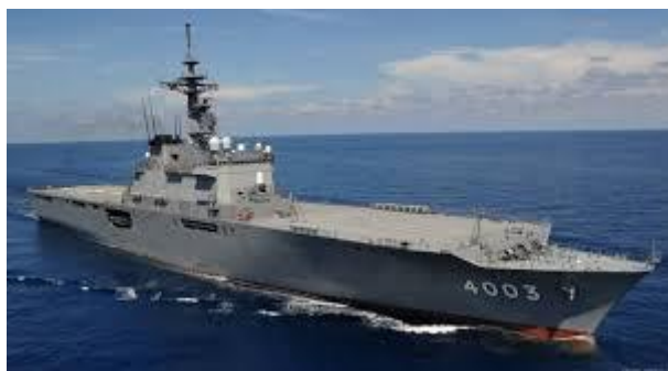
JDS Kunisaki (LST-4003)