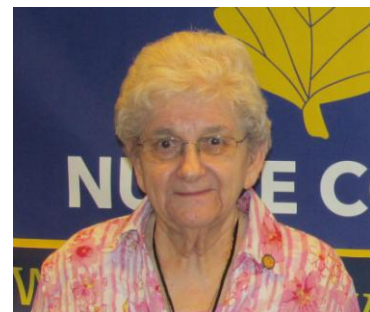
Reunion cruise 2012