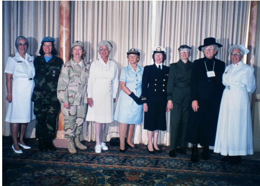
NNCA Reunion 1998 San Diego, CA