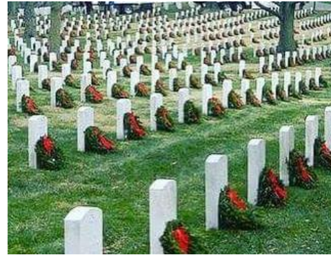
WREATHS ACROSS AMERICA

If you choose to donate, but are unable to attend the luncheon, you may send a check to Military Outreach Ministry, P.O. Box 461600, Escondido, CA 92046