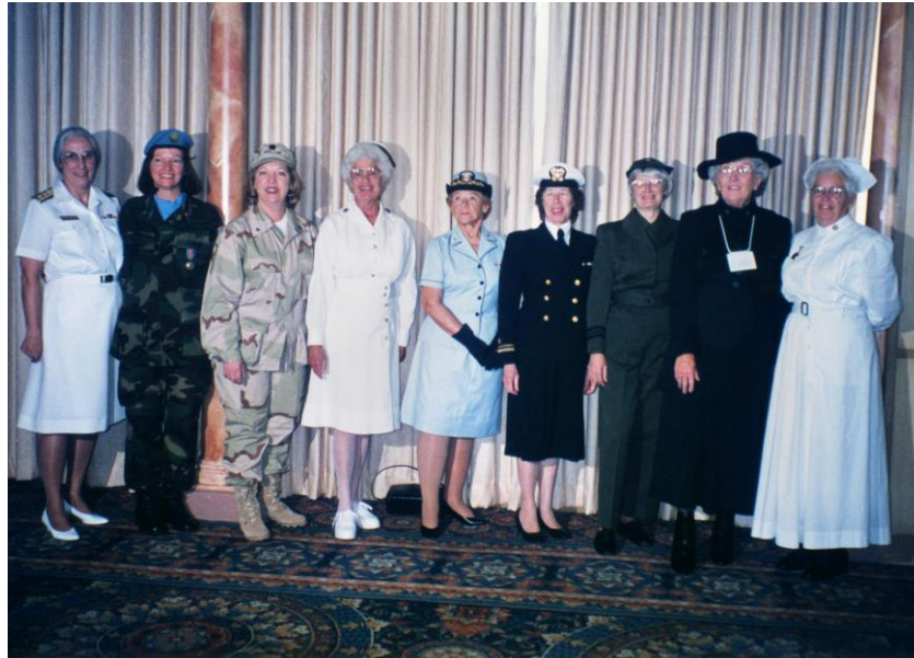
NNCA Reunion 1998 San Diego, CA

HAPPY 107 TH NAVY NURSE CORPS BIRTHDAY MAY 13, 2015